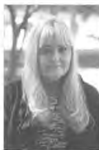
Master of Arts in Mathematics Graduate Program Head

Departmental – The MAM degree has two emphasis tracks: Mathematics and Mathematics Education. In order to be deemed adequately prepared for the mathematics track, an undergraduate degree in mathematics is required. The mathematics education track highly recommends that a candidate possesses an undergraduate degree in mathematics but the candidate may still qualify if the candidate has at least 12 hours of appropriate upper level undergraduate mathematics credit. Candidates designated as not being adequately prepared may be admitted conditionally with an approved leveling plan documenting additional coursework required to enable the candidate to be adequately prepared to pursue the MAM degree. Students admitted conditionally must complete the assigned leveling requirements before officially being admitted to the MAM degree program.