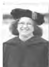
Master of Arts in Education/ Counseling