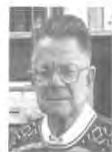
Master of Science in Geology Graduate Program Head