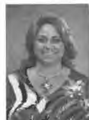
Master of Arts in Education/ Educational Leadership

In addition to completing the degree, candidates for certification as a Principal must earn a passing score on the Texas Principal certification exam and must have at least two years of creditable classroom teaching experience.