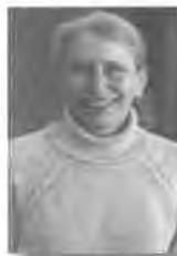
Master of Professional Accountancy Graduate Program Head

This degree is administered by the Office of Graduate Studies and Research through the faculty of the School of Business.