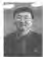
Master of Science in Computer Science Graduate Program Head

http://www.utpb.edu/utpb_student/grad_catalog/main_admissions.htm