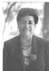
Master of Arts in Spanish Graduate Program Head

The program is administered by the Office of Graduate Studies and Research through the Faculty of Spanish, Department of Literature and Languages, College of Arts and Sciences.