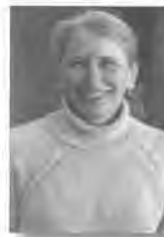
Master of Business Administration