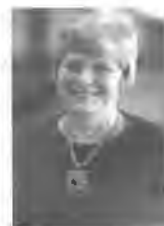
Master of Arts in Education/ Reading