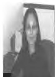
Master of Arts in History Graduate Program Head